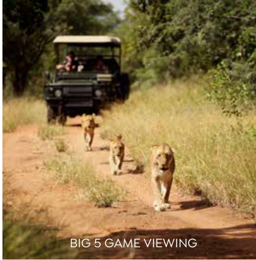
BIG 5 GAME VIEWING