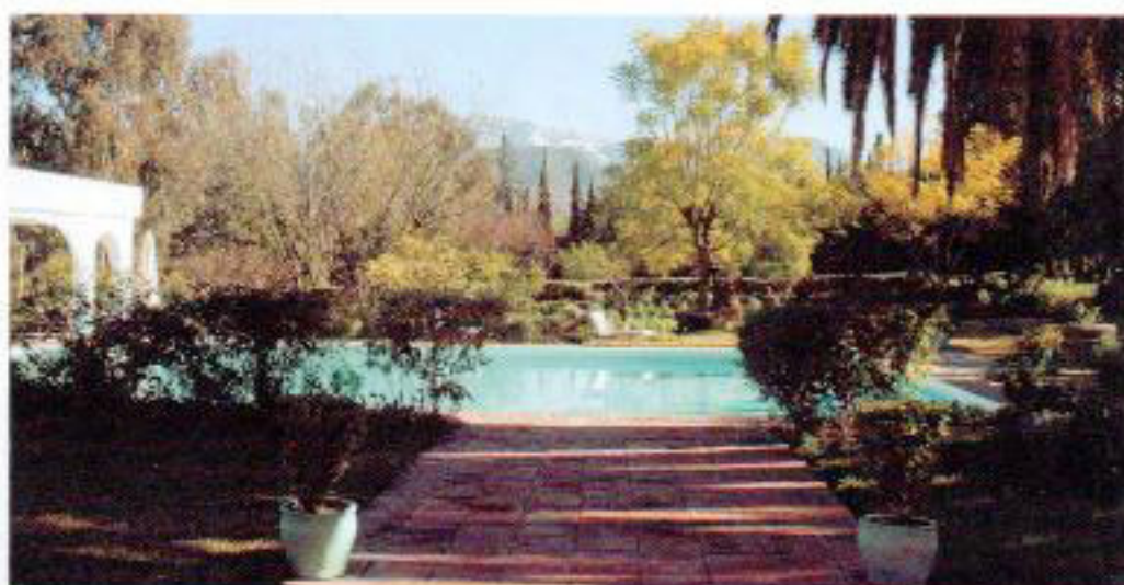
Villa No 76, South of Marrakech, Morocco

www.RoyalVillasEurope.com info@RoyalVillasEurope.com tel +44 203 239 7562 tel +357 99 571 677