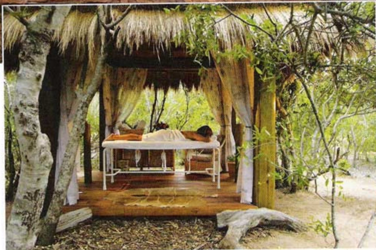
For your first and only elephant safari camp experience, in the lap of luxury, Camp Jabulani is an added must to your bush getaway diary.

Jabulani Camp is located in 13 000 hectares of Big Five country in the Kapama Private Game Reserve near Hoedspruit. It was opened in July 2003 by the camp's