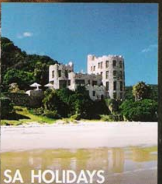
SA HOLIDAYS YOU'VE NEVER THOUGHT OF

HOW WOULD YOU SPEND R30 000? WE ASKED THE PROS