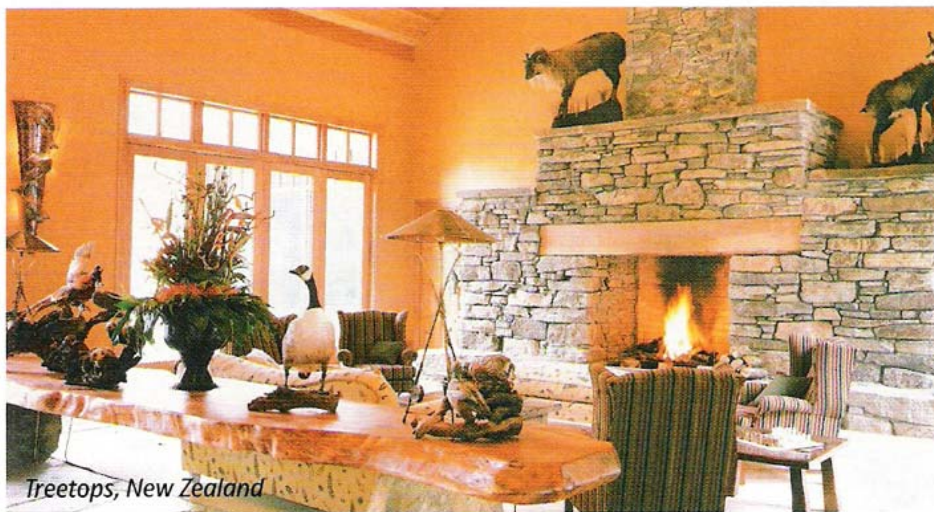
Treetops, New Zealand