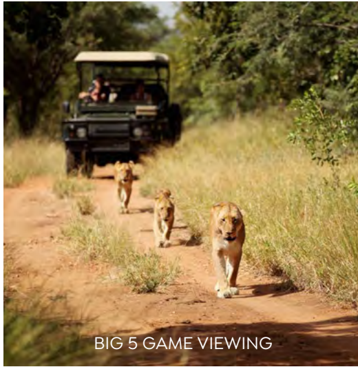
BIG 5 GAME VIEWING