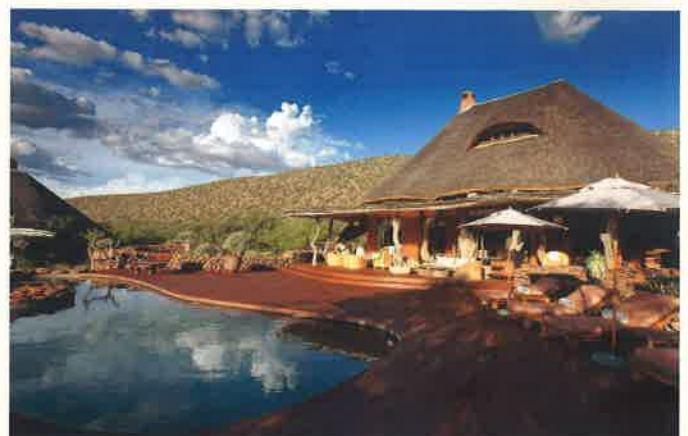
Tswalu Kalahari Private Game Reserve

South Africa's largest private game reserve—it's larger than eight and a half San Franciscos—Tswalu Kalahari hosts a maximum of 30 guests at a time in its two properties. The Motse's eight spacious and secluded legae (little houses) nestle at the foot of the Korannaberg Mountains, facing westward across the grasslands of the Kalahari. And the five luxury suites of Tarkuni—home of the Oppenheimer family, Tswalu's owners—are testimony to the family's superb taste, in both scenery and design.