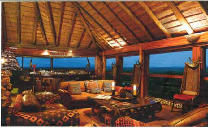
Ulusaba Private Game Reserve